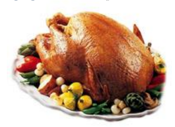
23 November 2023 U.S.A. Holiday Thanksgiving

(The Canadian Thanksgiving / Jour de l'Action de grâce is the second Monday of October)